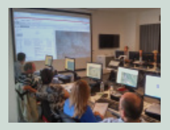
XVIII. Meeting of Croatian Surveyors

Education of employees in cadastral offices for the work with the new application